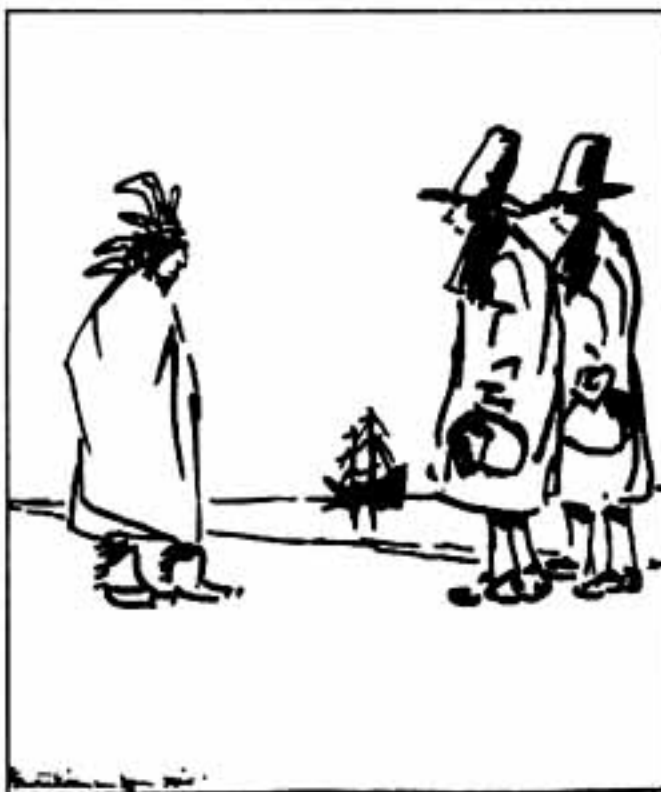
"You can't come in. The quota for 1620 is full."